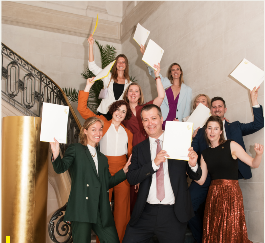
The laureates of this batch were handed out their certificates by the Minister-President of the Government of Flanders on 10 July 2023 at Errerahuis.

In September, they were dispatched to Flanders' diplomatic representations to the EU (Brussels), and in Berlin, Lilongwe, Maputo, Paris and Pretoria.