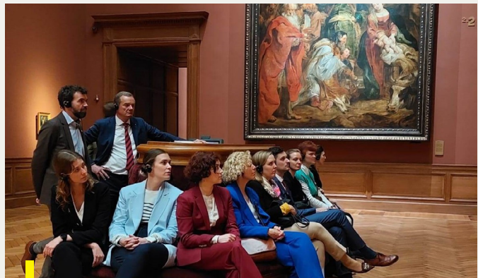
Prospective diplomats visiting the Royal Museum of Fine Arts in Antwerp (15 May 2023)

Almost all training activities took place in Brussels. The programme also included six working days of field visits to key stakeholders (city councils, ports, universities, sector federations, museums, innovation clusters, etc.) in Antwerp, Brussels, Ghent, Leuven and Ostend.