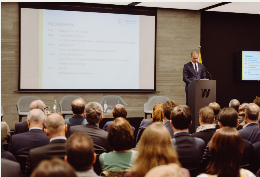
Keynote speech of the Permanent Representative of Poland to NATO during Flanders' Diplomatic Days (21 September 2023)

In summer 2023, our department - together with the Flemish Parliament and Flanders Investment & Trade - contributed to the Young Diplomats Forum in Brussels. This programme is hosted on a regular basis by the London-based Global Diplomatic Forum.