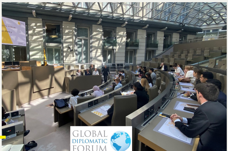
Young Diplomats Forum (Flemish Parliament, 7 July 2023)