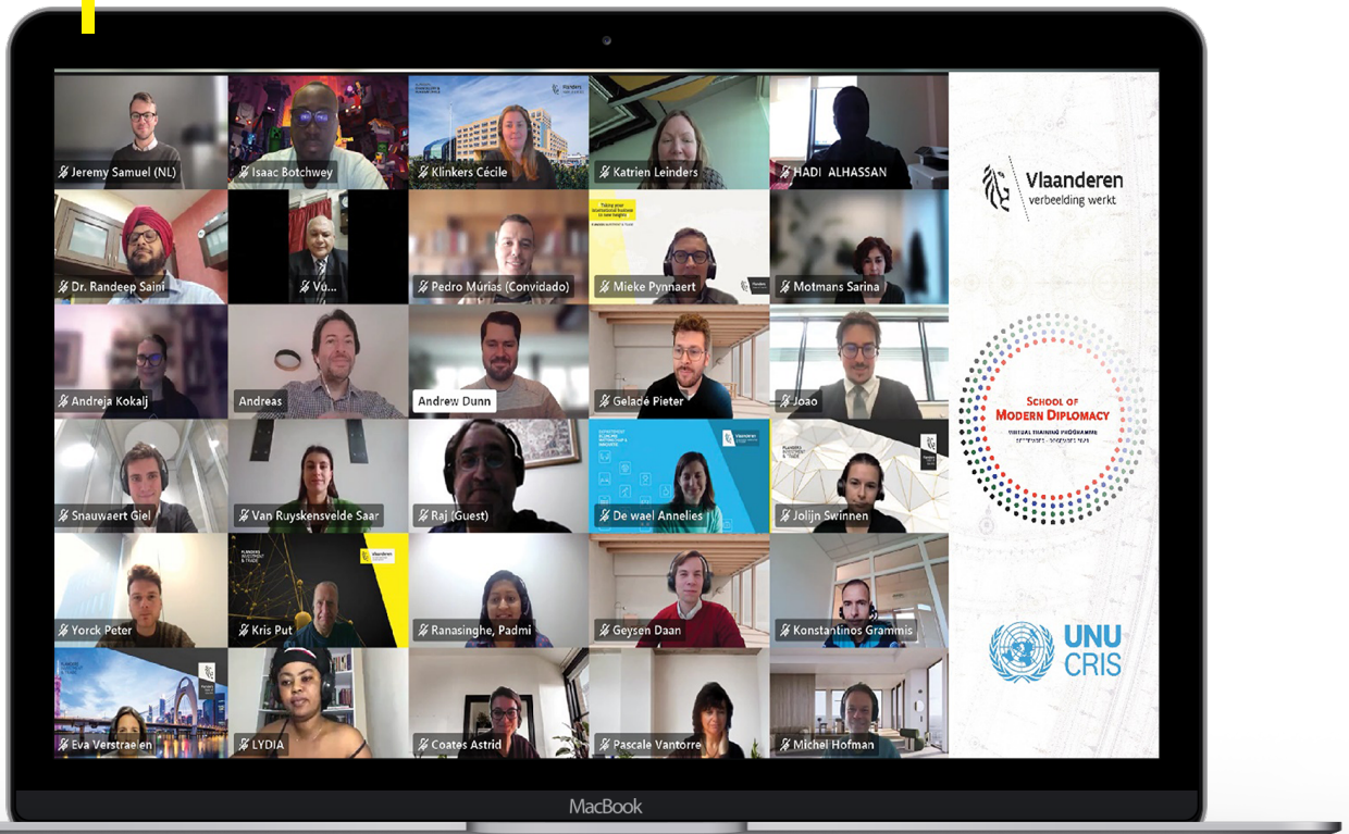
Screenshot of UNU-CRIS' lecture "Leadership in international relations: toolkits for modern diplomats" (9 November 2023)

More than a third of the lecturers were women and less than two thirds were men .