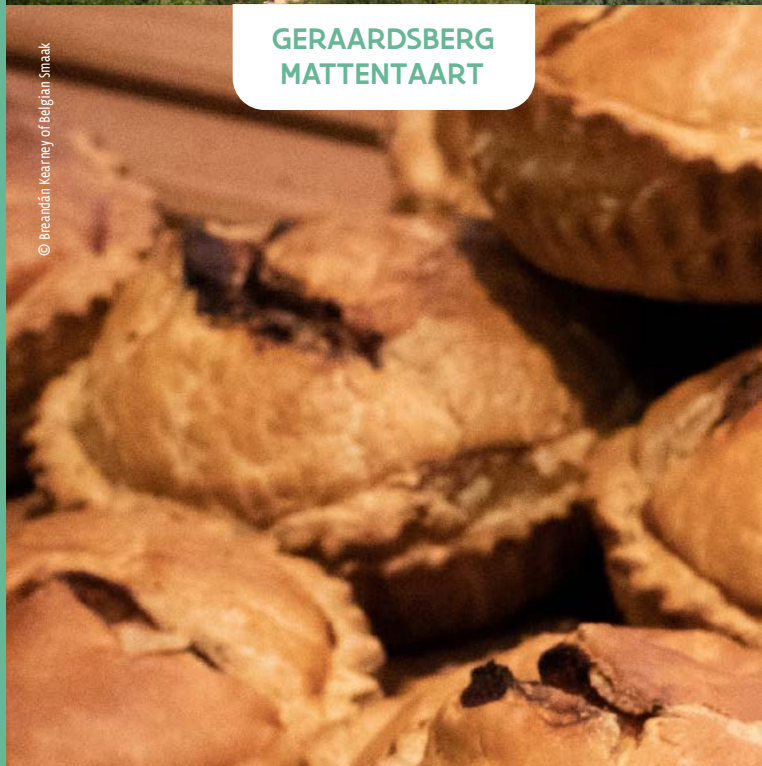
© Beaudán Kearney of Belgian Smaak