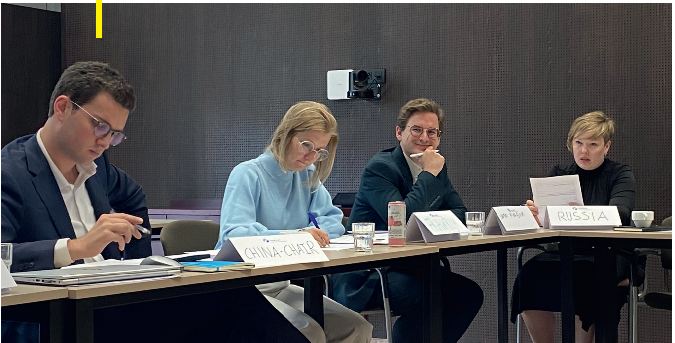
Negotiation training, Clingendael Institute, Brussels, June 2024

One-third (15/44) of external lecturers were women, and two-thirds (29/44) were men.