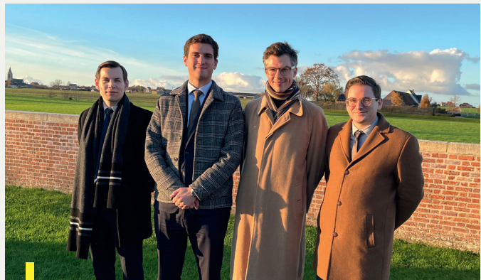
Diplomatic batch 'Tijl Uylenspiegel'. On a working visit to Ypres, 28 November 2024

The training courses generally took place in Brussels. The programme also invested six working days in familiarisation and site visits to stakeholder organisations (city councils, ports, universities, sector federations, museums, innovation clusters, etc.) in Antwerp, Brussels, Ghent and Ypres.