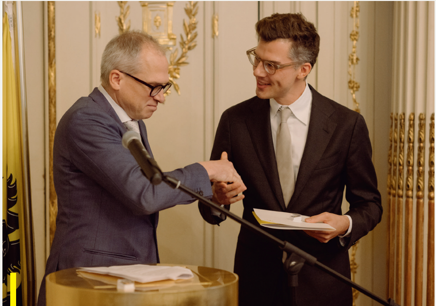
Laureates of the Diplomatic Academy receive their certificates from the Minister-President of the Government of Flanders. Brussels, 8 November 2024

The first laureate of the Tijl Uylenspiegel batch took office as Deputy General Representative of Flanders in London on 1 January 2025.