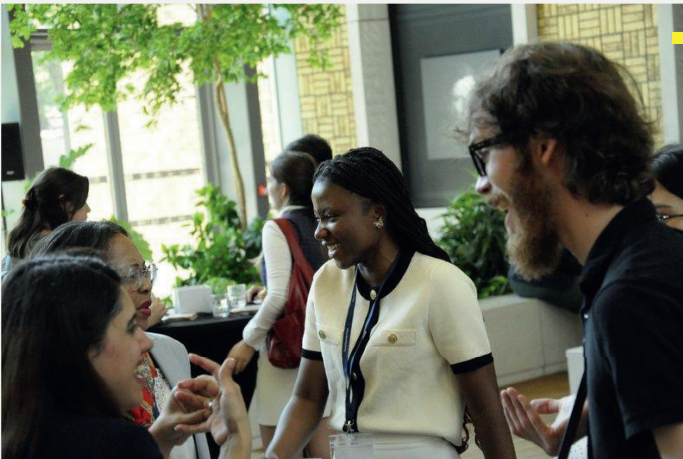
Kick-off of Young Diplomats Forum in Brussels (, 15 July 2024)